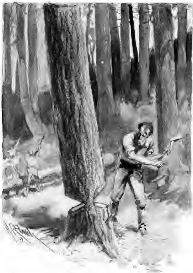
"AND THE SHINING BLADE DEALS BLOW ON BLOW."—Page 322.